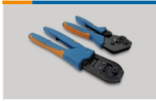
Hand Crimping Tools(32)