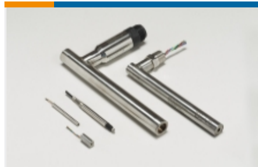
Linear Position Sensors - LVDT/LVIT(6)